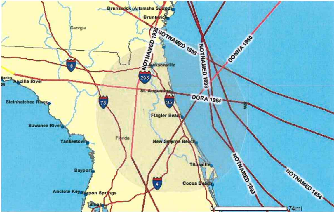
Figure 3: All Major Hurricanes within 65 NM of Flagler County 1851-2005